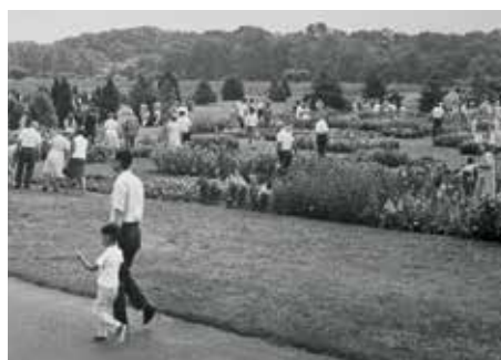
1967 Vegetable and Flower Garden Open House.