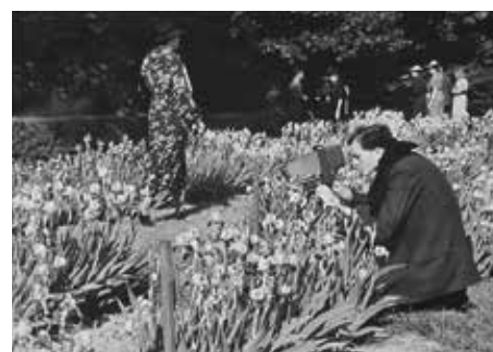
Iris Display Gardens.