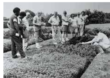
1987 Garden Display Event.