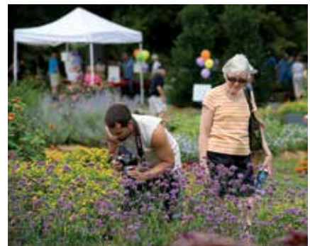
Rutgers Gardens Open House.