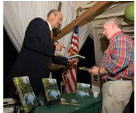
Gardens Gala and book signing.