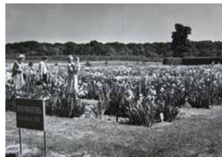
1939 Iris Field Day.