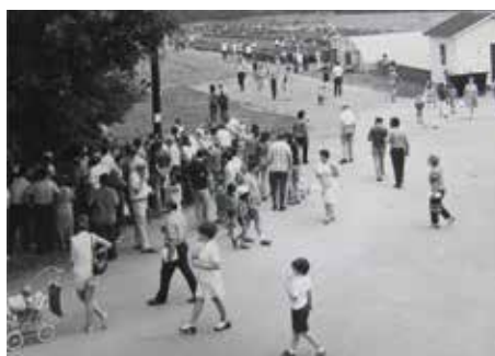
1974 Flower Garden Show.