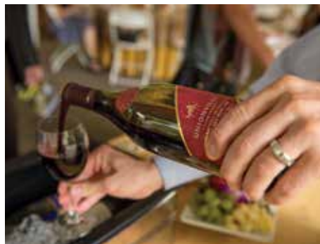
Gardens Gala and wine tasting.