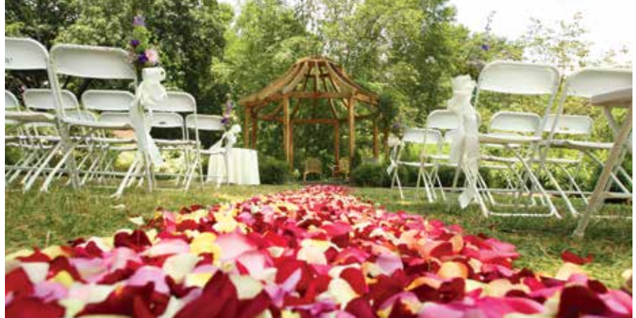
Rutgers Gardens wedding.