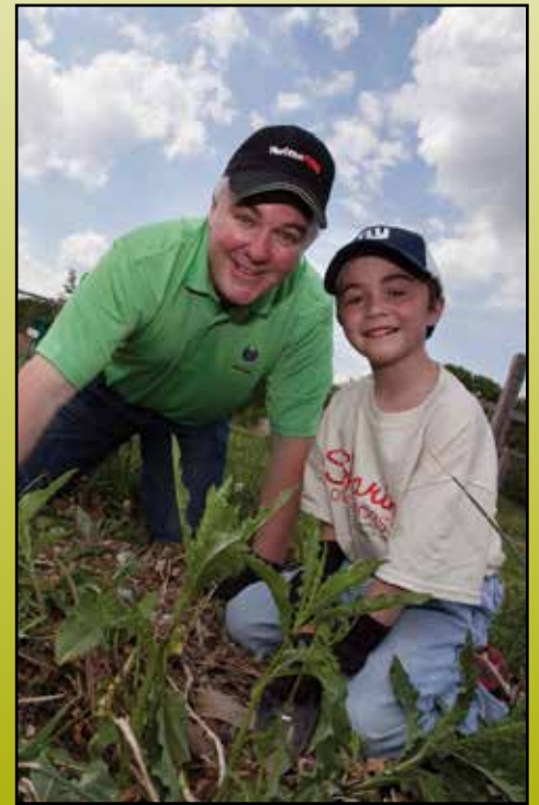
Verizon Foundation is working with the NJ School-Age Care Coalition (NJSACC) for a special day of volunteer projects, here at Rutgers Gardens.