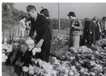
1939 Chrysanthemum Field Day.